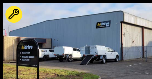
Adelaide Showroom & Installation 6 Wirriga St, Regency Park SA 5010