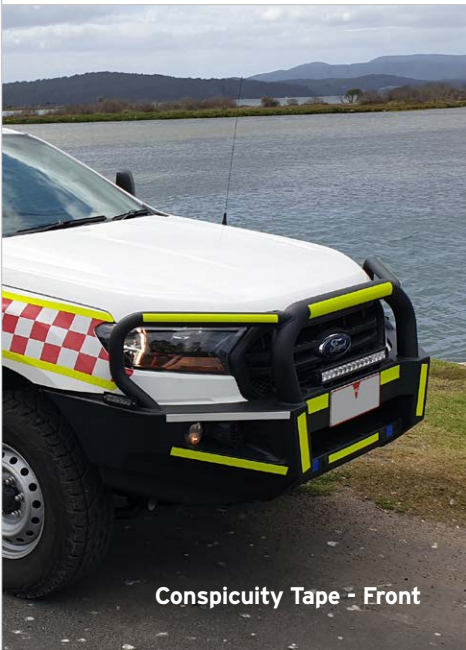
Conspicuity Tape - Front