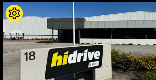
Western Manufacturing, Installation & Showroom 18 Catalano Rd, Canning Vale WA 6155