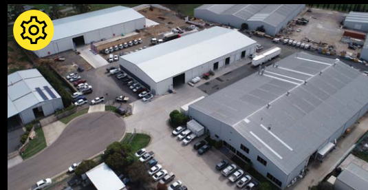
Eastern Manufacturing, Installation & Showroom 17 O'Sullivan Pl, Goulburn NSW 2580