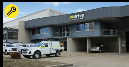
Sydney Showroom & Installation 10 Garner Pl, Ingleburn NSW 2565