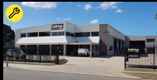
Brisbane Showroom & Installation 146 Crockford St, Northgate QLD 4013