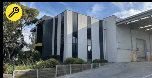
Melbourne Showroom & Installation 57 Hunter Rd, Derrimut VIC 3026