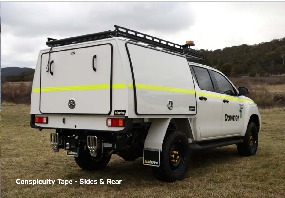
Conspicuity Tape - Sides & Rear